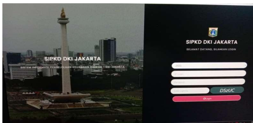
Figure 2. SIPKD main view

Through observations and interviews in the Kelapa Gading District, researchers identified key findings regarding using the SIPKD in local government financial reporting. As confirmed by the Head of Finance, the SIPKD has been operational in the district's finance department since 2013. This system enhances the implementation of regional financial management regulations, focusing on efficiency, accountability, and transparency. Before implementation, the local government conducts intensive training for financial administration staff to ensure proficiency in the system. As confirmed by officials, the training provided is essential for staff to avoid data entry errors, which can be amended by contacting the DKI Jakarta Regional Financial Management Agency if necessary. Developed by the Ministry of Home Affairs, the SIPKD aims to streamline data transfer and improve the efficiency of regional financial data management, representing a significant tool for local governance compliance. The following is the main view of the SIPKD application: