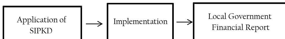
Figure 1. Research Conceptual Framework

The government requires an accounting information system to generate comprehensive financial reports and insights into regional financial statements. SIPKD developed by the Directorate General of Regional Finance, aims to enhance regional financial management by improving data transfer efficiency and streamlining data collection. Adhering to Governor Regulation Number 161 of 2014, SIPKD helps local governments create a robust financial information system that ensures orderly documentation and integrity with related systems.