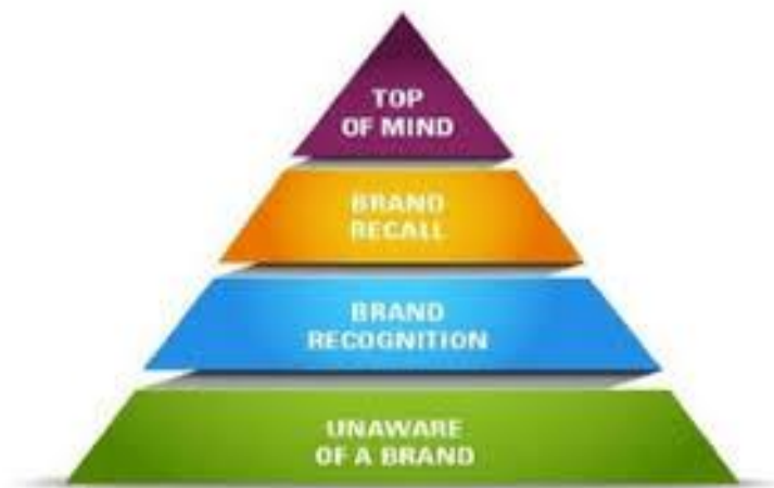
Figure 2. Brand Awareness Pyramid

Aaker (2006) defines brand awareness as the extent to which consumers recognize or recall a brand within a particular product category. This perception reflects consumers' perception of a brand's presence in the marketplace. The more a consumer identifies with a brand, the more likely they are to consider it in their purchasing decision. A consumer's or customer's ability to recognize and recall a brand can vary depending on how effectively a company communicates the brand and how it shapes consumer perceptions. Therefore, businesses need to understand consumers' levels of brand awareness to develop appropriate and effective branding strategies.