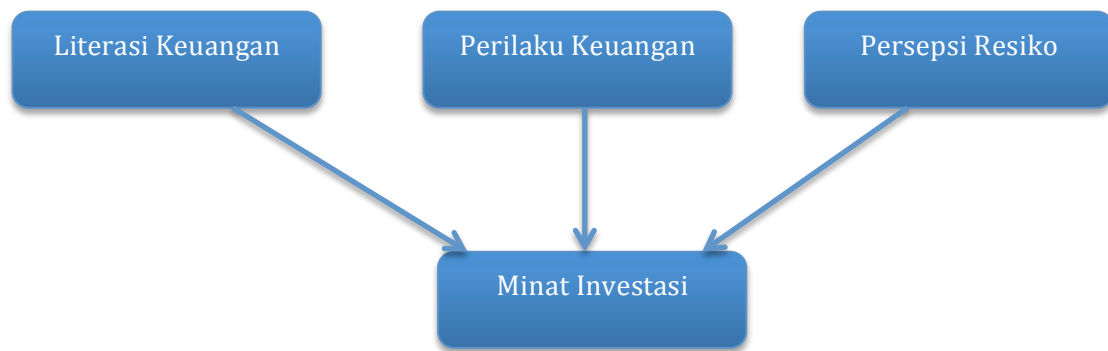
Figure 2. Thinking Framework